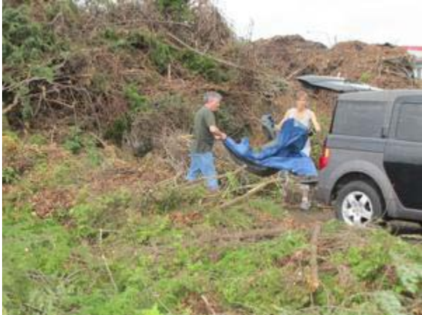
Local residents deposit yard waste at Holland Mulch.