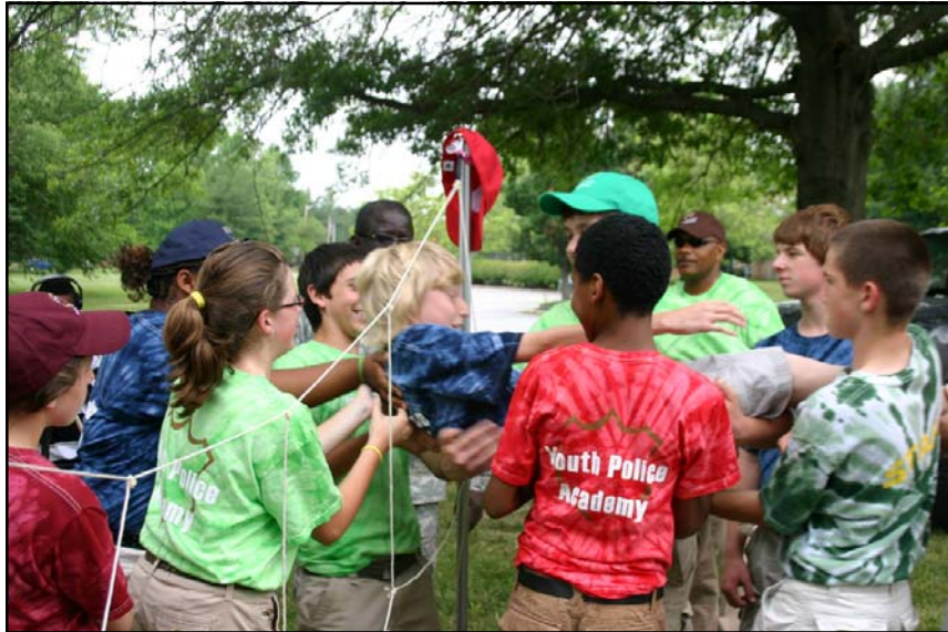
Youth Academy campers work together in team building exercise.

The fourth annual New Castle County Police Youth Academy was once again well received by the 29 students who attended the program this year. The re-vamped program was modeled after the Citizens Police Academy which provides an in-depth overview of the police department.