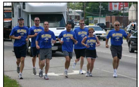
In 2008, the Law Enforcement Torch Run raised 34 million dollars for Special Olympics around the world.

Below is a picture of the Colonel and five other New Castle County Police Officers who were participating in the Delaware Law Enforcement Torch Run.