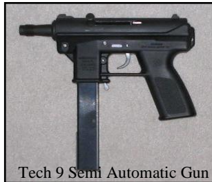
Tech 9 Semi Automatic Gun

NEW CASTLE —In what is often described as just a routine car stop, the encounter has lead officers to the arrest of a fugitive wanted in a Wilmington shooting and the recovery of two loaded handguns. Members of the Mobile Enforcement Team arrested the three adult male subjects for various weapon violations after they were stopped in a county parkland (after dark) while smoking marijuana inside their car. As a result of the stop, police located and seized a small quantity of marijuana, a loaded Tech 9 handgun, and a .22 caliber handgun. On Monday (1/25), officers from the Mobile Enforcement Team (MET) were conducting a roving patrol along the Route 9 corridor in an effort to address violent crime trends and quality of life issues. At 5:30 p.m., M.E.T. officers observed a suspicious vehicle that was parked in the Rosehill Gardens Parkland (in violation of a county code regarding trespassing in the park after dark).