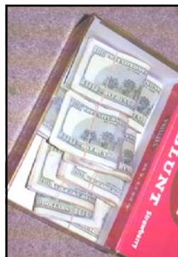
$10,000 in cash

The Drug Unit executed a search warrant at a Kensington home and arrested the two residents after detectives recovered 785 grams of marijuana, a large amount of drug proceeds (cash), a handgun, a set of brass knuckles, two marijuana plants and gun ammunition. For the past several weeks, the drug unit conducted an investigation into illegal drug activities that have occurred at a home in the unit block of Lockview Drive. On Friday (6/5), officers executed a search warrant at the home and found the aforementioned cash, drugs, and weapons inside. As a result of the investigation, police have seized the following items: $10,552 in cash, a 2003 Cadillac Escalade, a 2002 Cadillac Escalade, a 1998 Lexus GS 300, a 1993 Lexus GS 300 and a Suzuki GXR motorcycle. The following residents have been charged with possession with the intent to deliver marijuana, maintaining a dwelling for keeping a controlled substance, conspiracy, possession of drug paraphernalia, and three counts of endangering the welfare of a child: Tina Landreth, (34) has been arraigned and released after she posted a $2,500 secured bail. Gerardo Rico (29), a 29 year old male was also charged with possession of a deadly weapon during the commission of a felony and possession of a deadly weapon by a person prohibited.