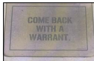
Doormat at suspect's front door