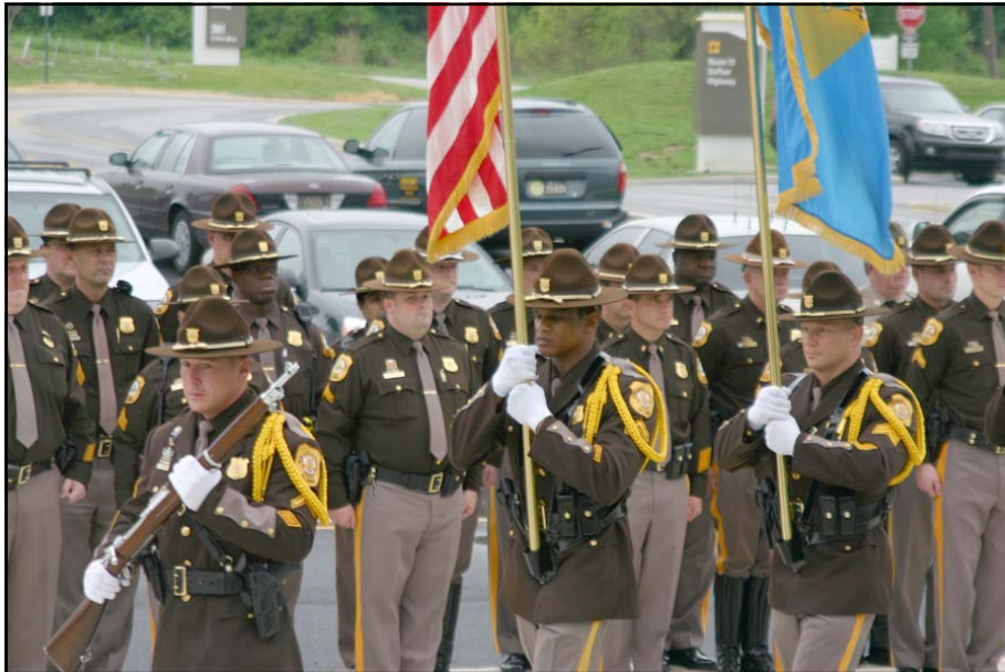
Honor Guard Officers Presenting our Colors